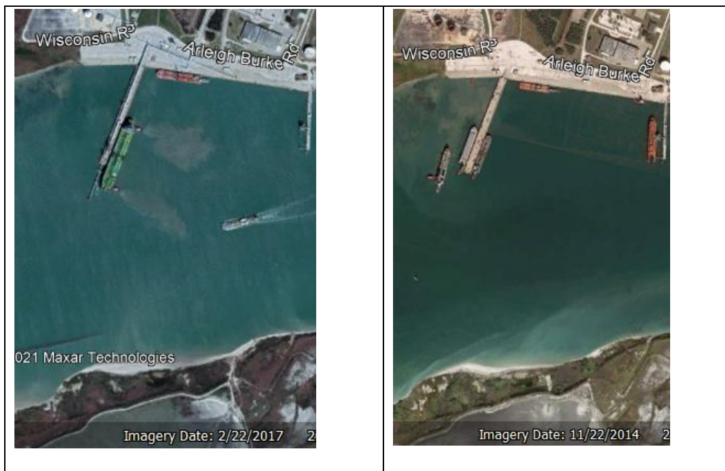
Exhibit 18 at 3.

As early as March 2019 the Texas Parks and Wildlife Department specifically referenced the satellite images below showing the prop wash occurring at the MODA site, and the potential for damages to seagrass: