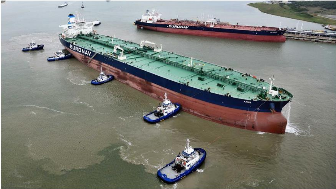
Tugs jockey the French-flagged, Very Large Crude Carrier Anne at the Moda Ingleside Energy Center at the mouth of the Corpus Christi Ship Channel. Private-equity-backed Moda Midstream LLC owns and operates the terminal, which can load such outside tankers and has 2.1 million barrels of storage capacity, with an additional 10 million under construction. The export terminal is already one of the largest in the U.S.

Image at https://www.hartenergy.com/exclusives/private-equitys-growing-role-180245 , last visited August 11, 2021. See also Exhibit 2, ¶ 9.